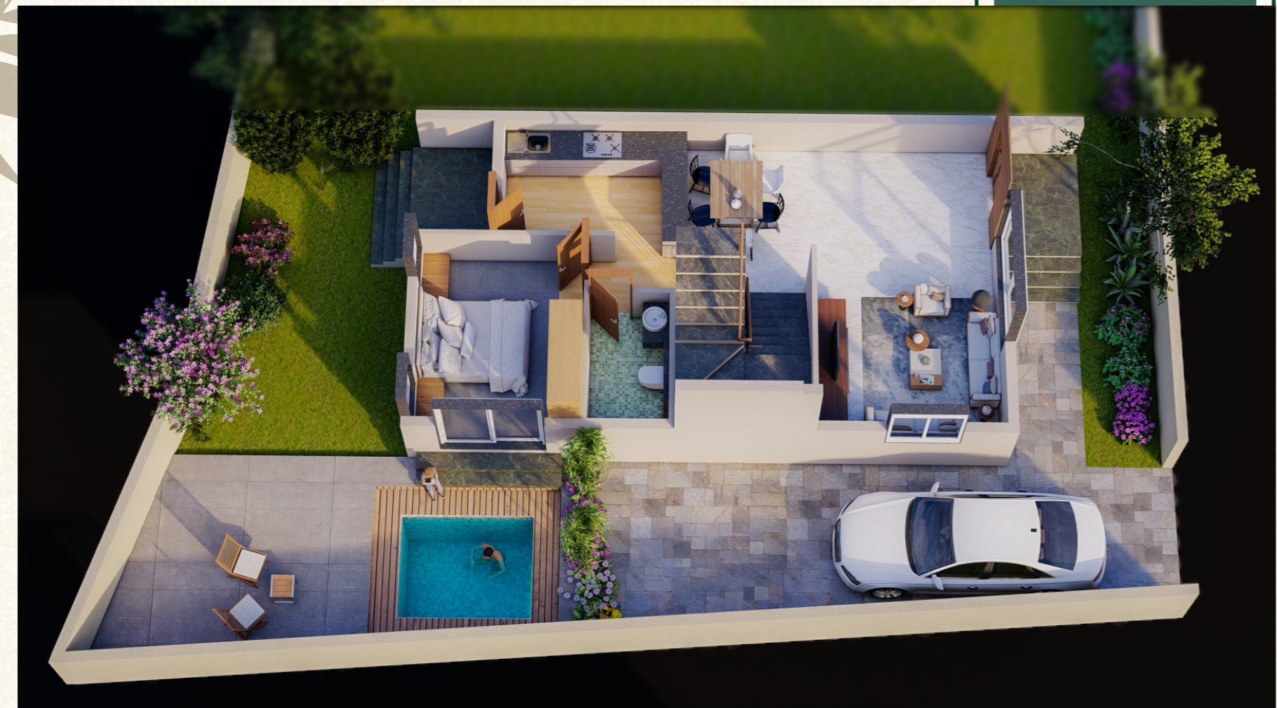
Isometric View – Ground Floor