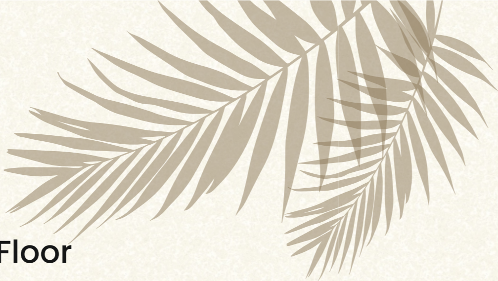
Isometric View – Ground Floor